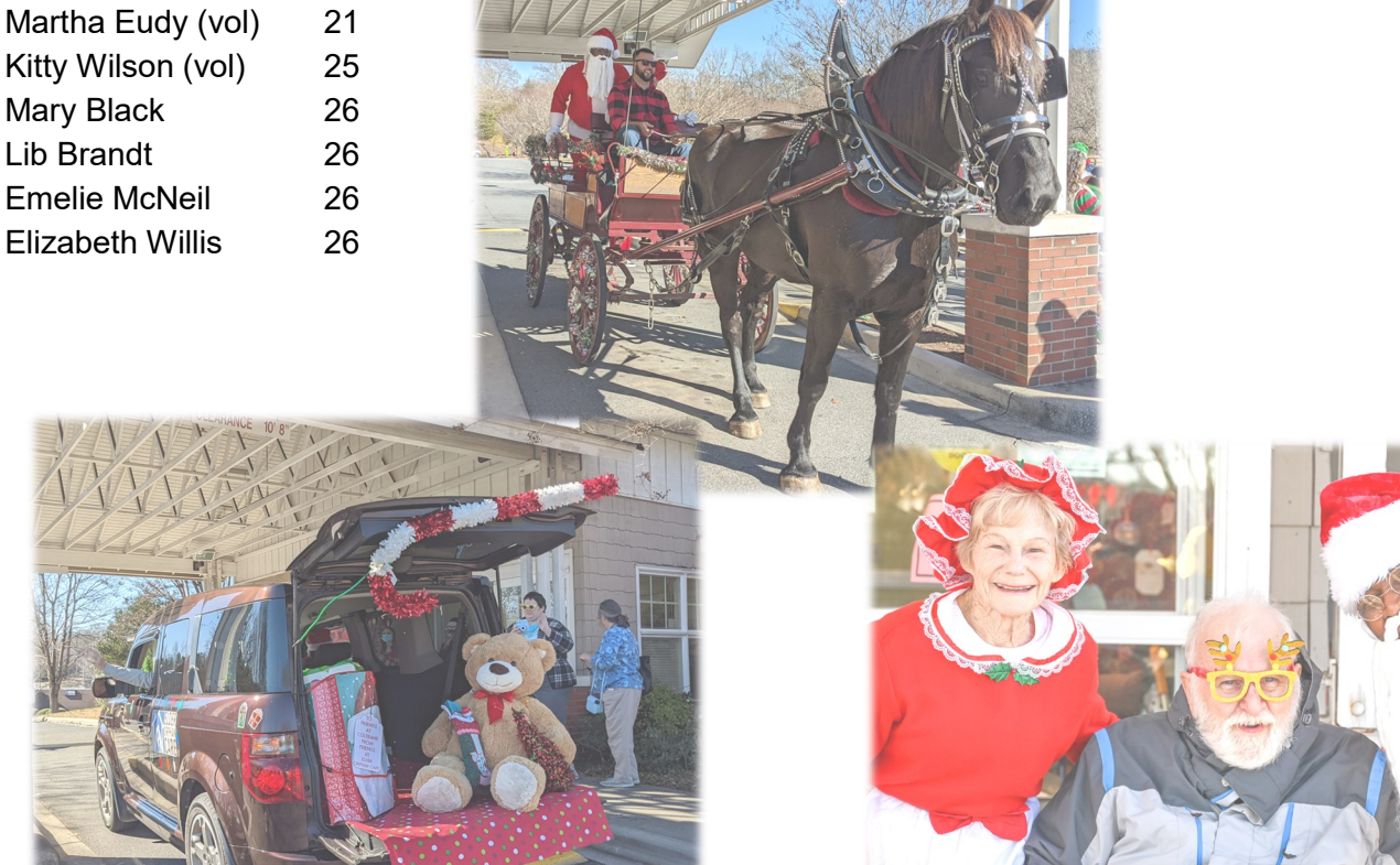
Special thanks to Cabarrus Resource Link for the Christmas caravan and donations from our needs list!