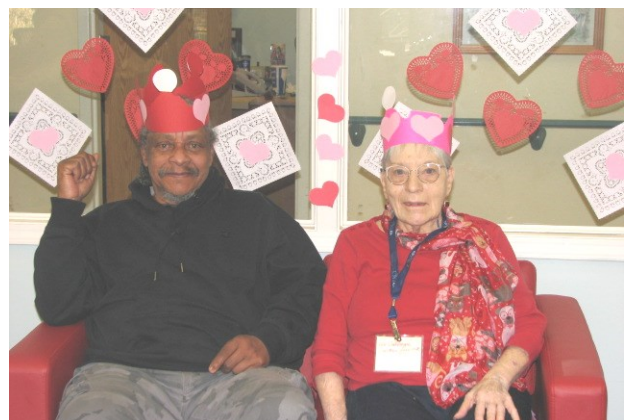
were crowned Coltrane LIFE Center's Valentine's Day King & Queen